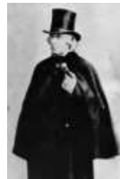
Amos Bronson Alcott