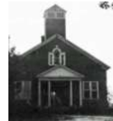
Town Hall 1923

The Beecher Memorial became the new home of the library. The library continued to grow for ten years while it was housed in Beecher Memorial.